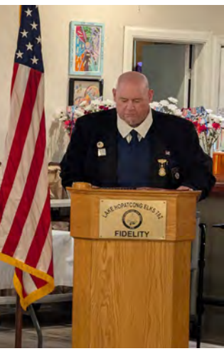
Special Thank You To The Lodge Officers, Our Honor Guard, Our Veterans and the Boy Scouts!